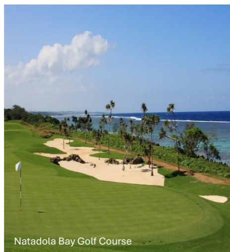
Natadola Bay Golf Course