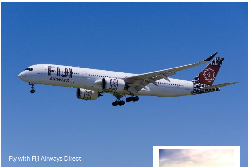
Fly with Fiji Airways Direct

With free-flowing drinks, world-class golf, expert hosting and the ultimate in relaxation and luxury, the 2026 Fiji Signature Golf Tour promises an unforgettable blend of sport and paradise.