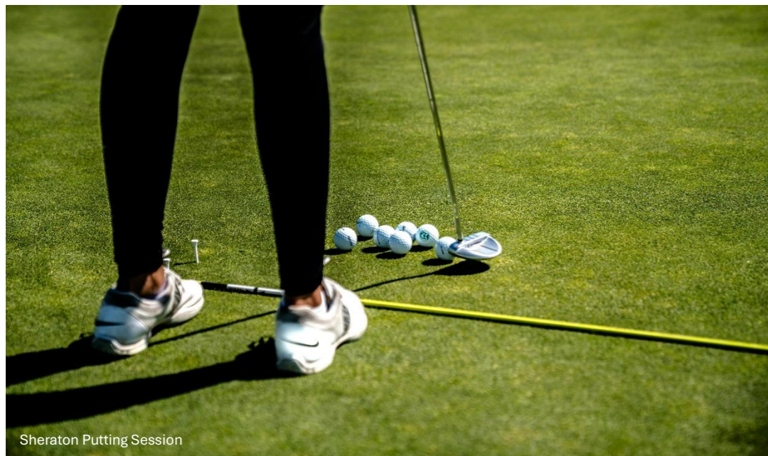
Sheraton Putting Session

Throughout the tour, guests will enjoy far more than simply playing great courses. Your host will be actively involved both on and off the course, helping you refine your skills, build confidence, and ultimately make golf more enjoyable in a relaxed and supportive environment.