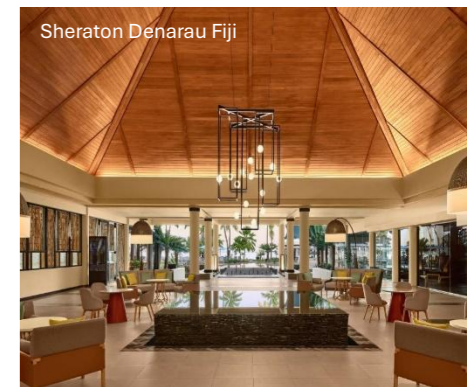
Sheraton Denarau Fiji

Experience tropical luxury at Sheraton Fiji Golf & Beach Resort, where beachfront relaxation meets world-class golf. Your stay includes stylish accommodation, premium resort facilities, championship golf access, exceptional dining, and authentic Fijian experiences — creating the perfect balance of comfort, leisure, and unforgettable island hospitality.