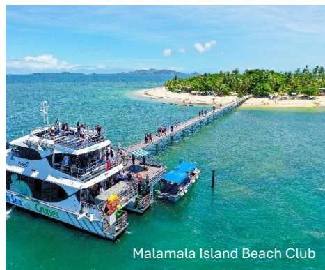
Malamala Island Beach Club