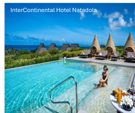
InterContinental Hotel Natadola

Indulge in luxury at the InterContinental Fiji Golf Resort & Spa at Natadola Bay, where pristine beaches and championship golf combine. Enjoy elegant accommodation, world-class resort facilities, exceptional dining, spa experiences, and unforgettable golf — all set within Fiji's most breathtaking coastal landscape.