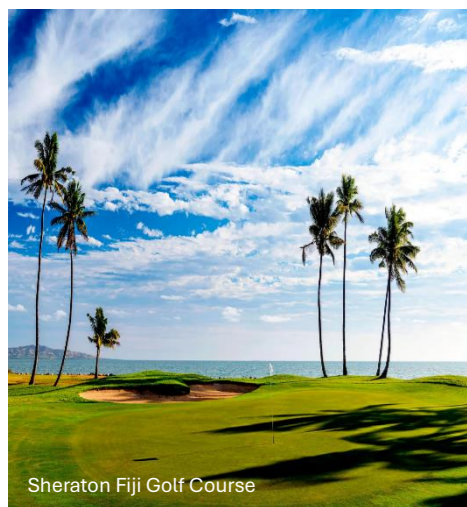
Sheraton Fiji Golf Course

Beyond its white-sand beaches and swaying palms, Fiji is home to world-class golf courses set against breathtaking ocean and mountain backdrops. Players can enjoy championship layouts designed to challenge golfers of all levels while soaking in spectacular island scenery at every hole.