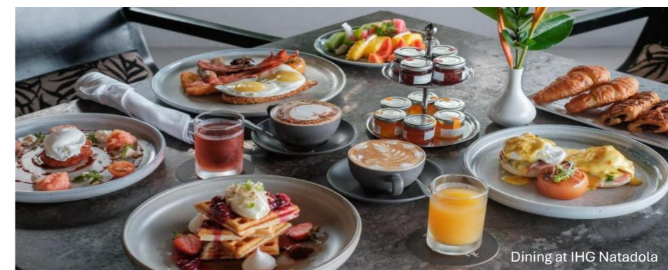
Dining at IHG Natadola