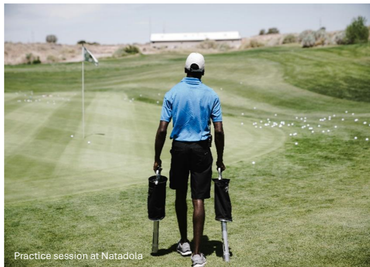
Practice session at Natadola

By learning simple, repeatable fundamentals and gaining clarity around shot selection, guests begin to trust their swing and decision-making. On-course guidance helps remove doubt and overthinking leading to more consistent and enjoyable rounds.