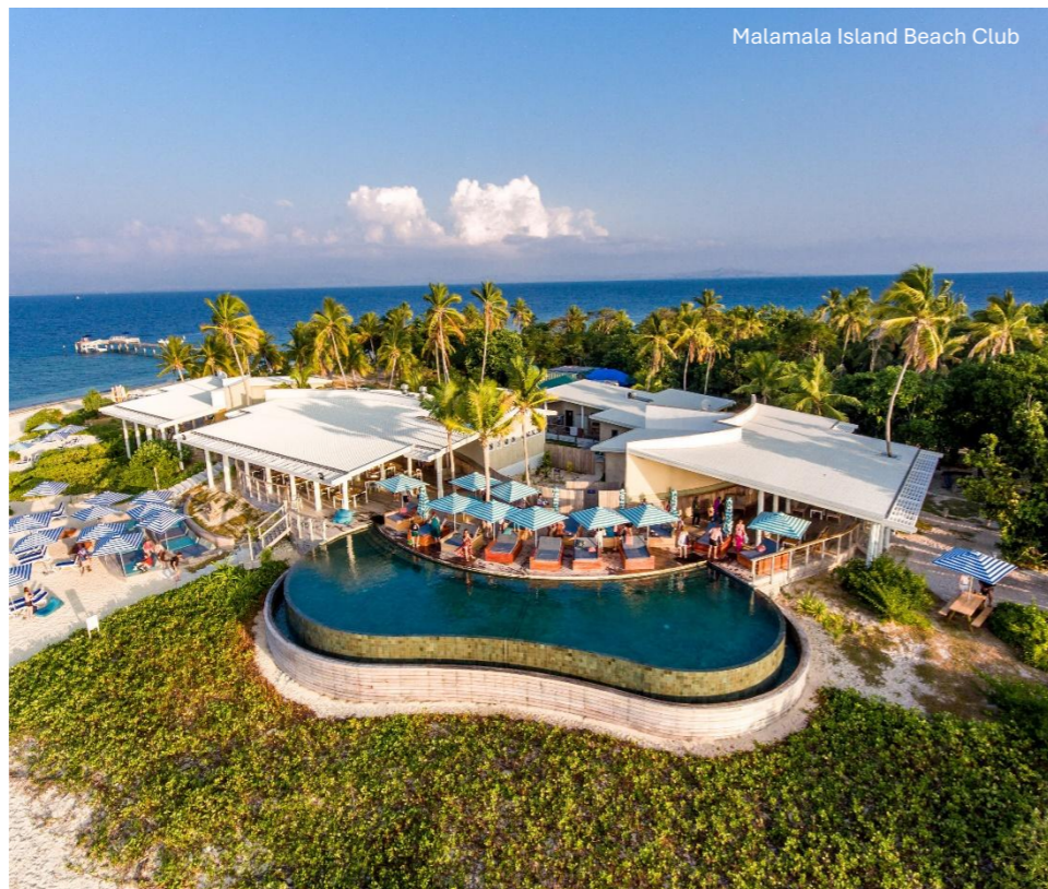
Malamala Island Beach Club

Malamala Beach Club on Malamala Island, Fiji is the world's first beach club on its own island. Just 25–30 min from Port Denarau, enjoy white-sand beaches, infinity pools, cabanas, watersports, Pacific-style food and cocktails in a laid-back island setting.